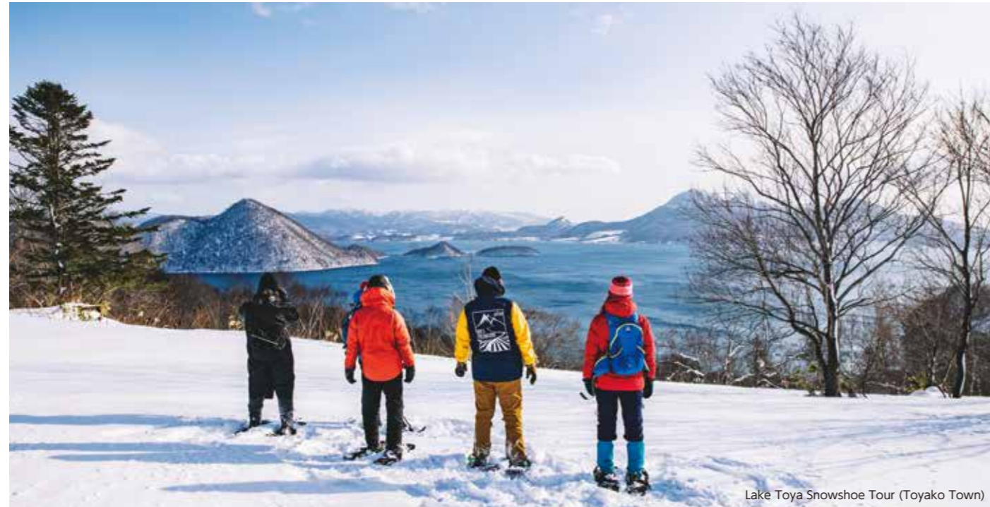
Lake Toya Snowshoe Tour (Toyoko Town)