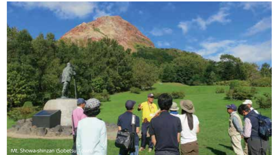
Mt. Showa-shinzan (Sobetsu Town)

◆ Toya-Usu UNESCO Global Geopark https://www.toya-usu-geopark.org/english/