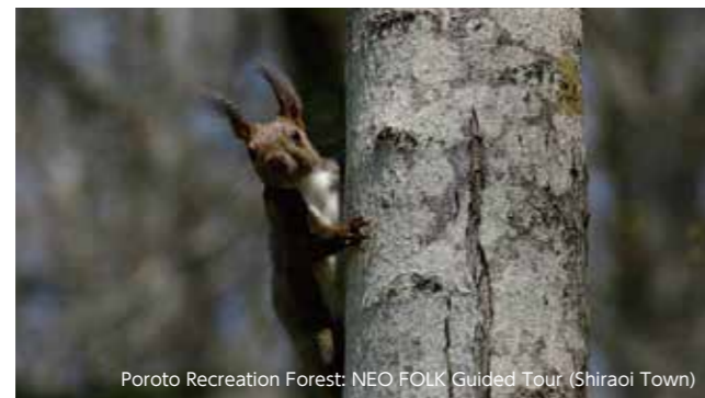
Poroto Recreation Forest: NEO FOLK Guided Tour (Shiraoi Town)

☎ 159 195 015*30 ● Approx. 6 min by taxi from JR Bokoi Station