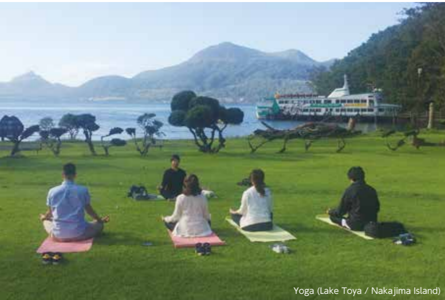
Yoga (Lake Toya / Nakajima Island)

There are various activities to do in Iburi during the refreshing seasons from spring to autumn. Enjoy a variety of experiences, from outdoor to cultural.