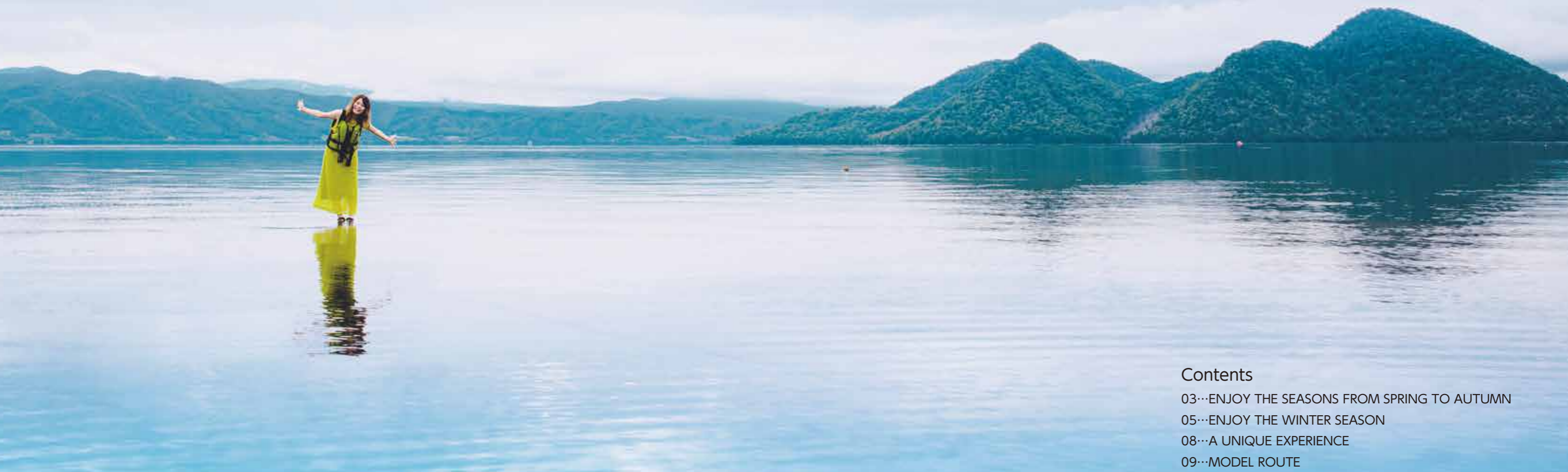
Lake Toya Zero Point (Toyako Town)

The Iburi area, located in south-central Hokkaido, is blessed with wonderful natural environments such as the UNESCO Global Geopark and Ramsar Convention-registered wetlands, and you can enjoy outdoor activities here all year round. Lake Toya, the venue for the 34th G8 Summit held in Hokkaido in 2008, is known as a leading resort area in Hokkaido, while Noboribetsu Hot Spring, which boasts abundant hot spring quality and quantity, is a popular hot spring area in Japan. You can also experience the various appeals of Ainu culture at "Upopoy Ainu Museum and Park", a national center for the Ainu, an indigenous people of Japan. Another appeal of Iburi is the ease of access from New Chitose Airport, the gateway to the skies of Hokkaido, and many tourists from within and outside Japan come to visit Iburi. Nature, scenic views, food, experiences, and personal encounters... In the Iburi area, thrilling, treasured experiences await you.