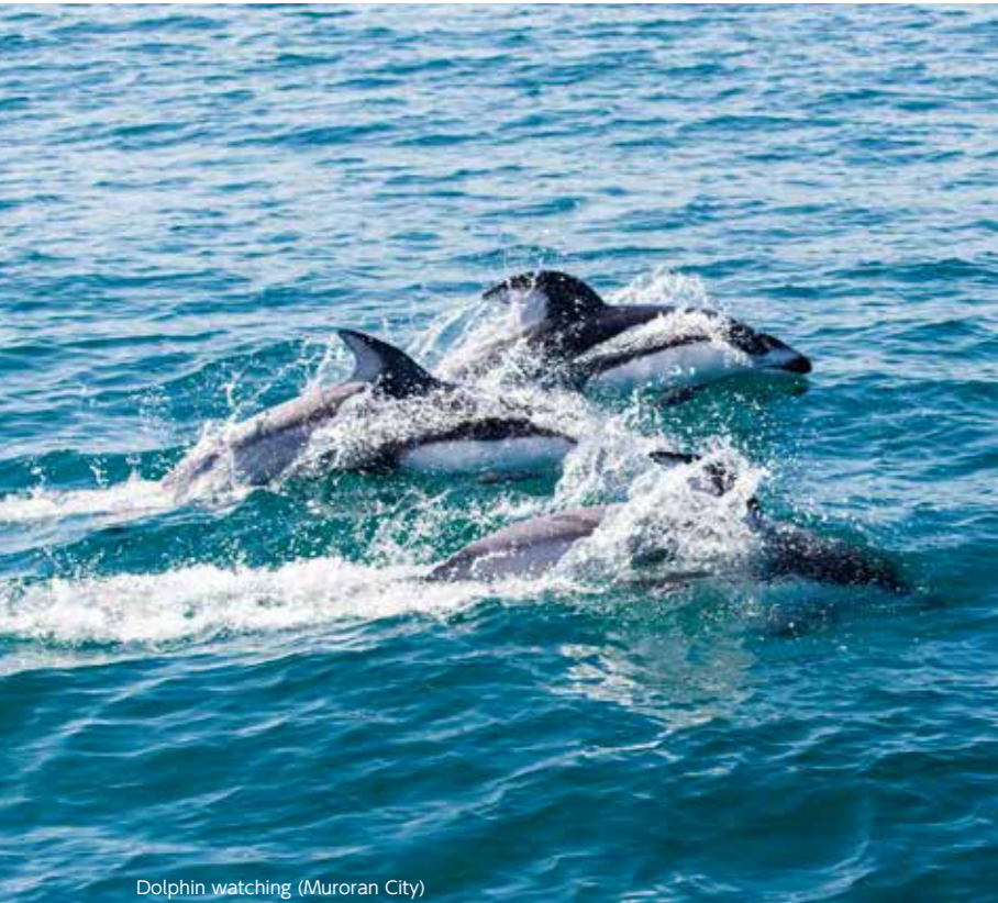
Dolphin watching (Muroran City)

Please feel free to use it as a reference.