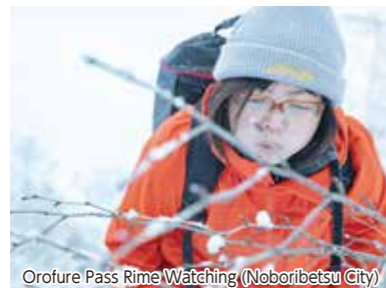
Orofure Pass Rime Watching (Noboribetsu City)