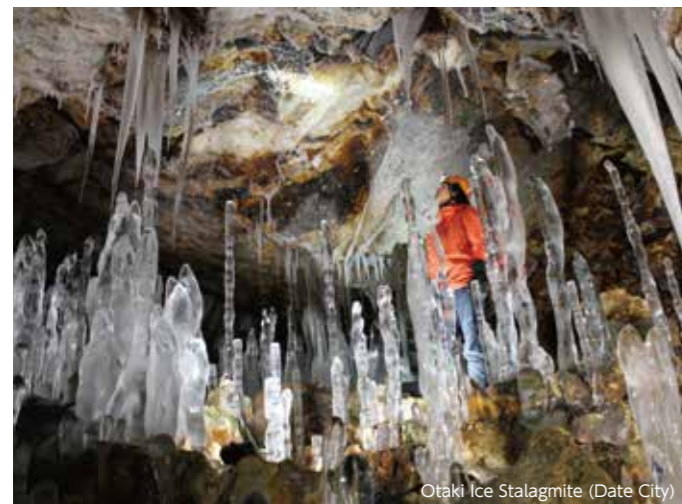
Otaki Ice Stalagmite (Date City)