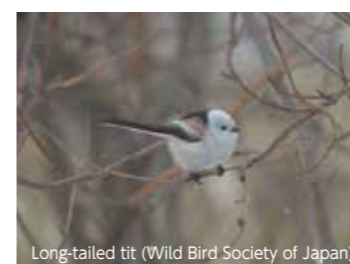
Long-tailed tit (Wild Bird Society of Japan)

● Approx. 10 min by taxi from JR Numanohata Station