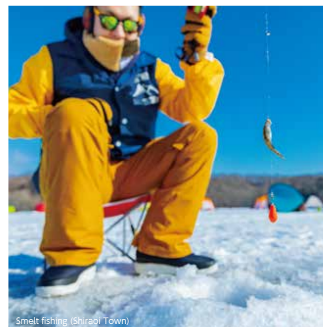
Smelt fishing (Shiraoi Town)

● Approx. 50 min by bus from JR Tomakomai Station