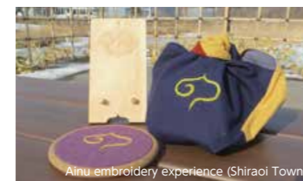
Ainu embroidery experience (Shirai Town)