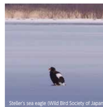
Steller's sea eagle

● Approx. 5 min by taxi from JR Shiraoi Station