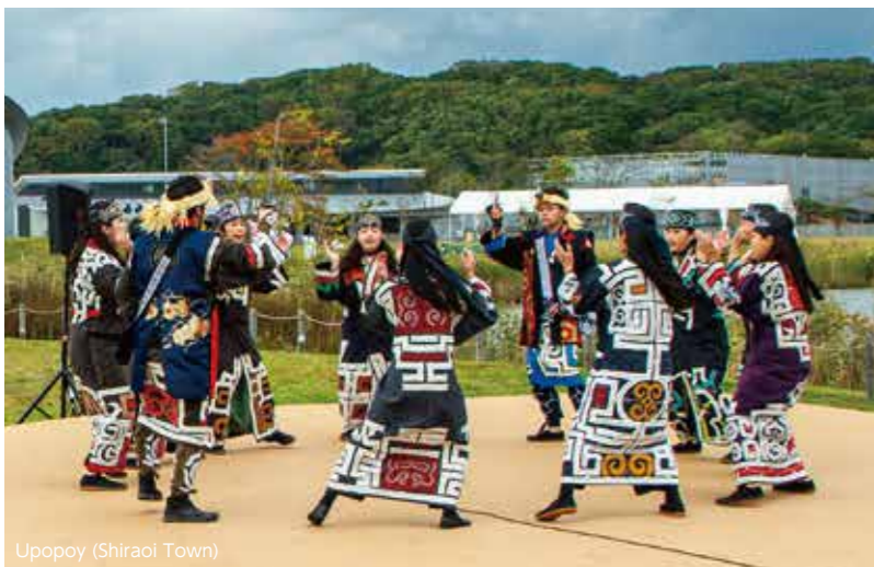
Upopoy (Shiraoi Town)